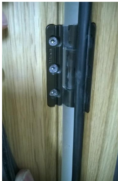
Photo 5 - Pre-drilled fixing location