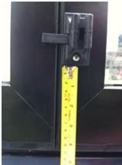
Photo 12 – Female panel catch section with arm projecting across adjacent panel

The panel catch is in 2 parts with the male part fixed to the single door panel. This panel catch should be fixed on the side rail of the door 100mm away from either the top or bottom edge of the panel so to avoid the corner cleat within the door panel. (See photos 12-14 below). If the single leaf panel releases from the stack of doors when the system is fully open then the male part of the panel catch has been fitted the wrong way round, remove this part rotate 180° and refix to rectify. The cut-out should always face the opposite way the arm of the catch projects.