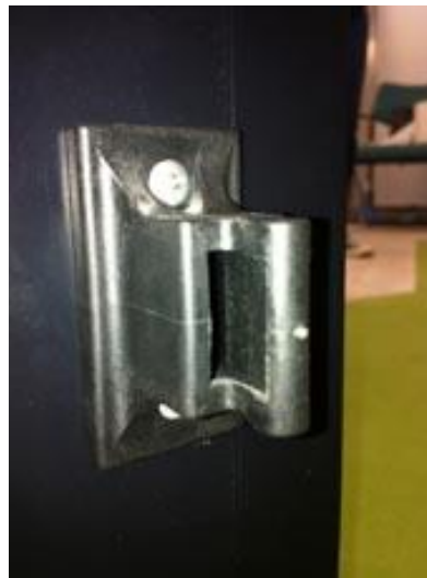
Photo 13 – Male panel catch section with cut-out which should face the opposite way of the projecting arm of the female section