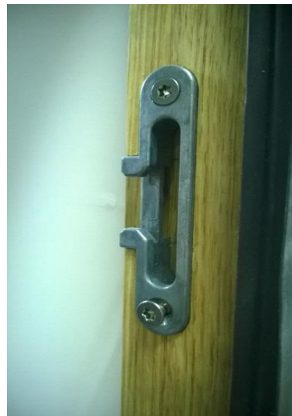
Photo 6 --Gasket covers pre-drilled fixing location and screw once fitted