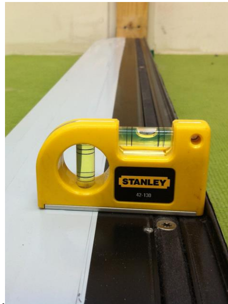
Photo 4 Checking sill is level

Drill and fix down the sill section through the thermal break of the sill on to previously levelled base. Double check after fixing down that the sill is level across its width with no low points and also from front to back to prevent 'twisting' (see photo 4) Ensure fixings points are approximately 100mm from each end and at maximum centres of 500mm. Do not try to position back of sill section over an open cavity, the back of the sill must be supported by a solid base to prevent twisting